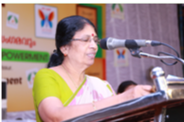
Hon. Mayor Smt. Ajitha Jayarajan